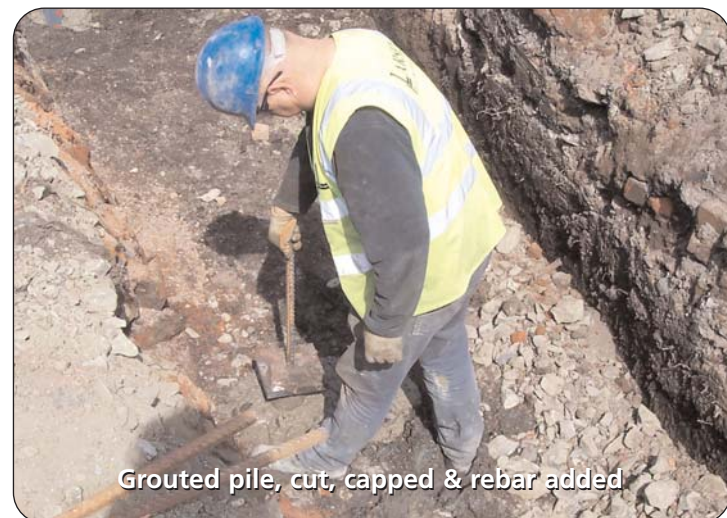
Grouted pile, cut, capped & rebar added