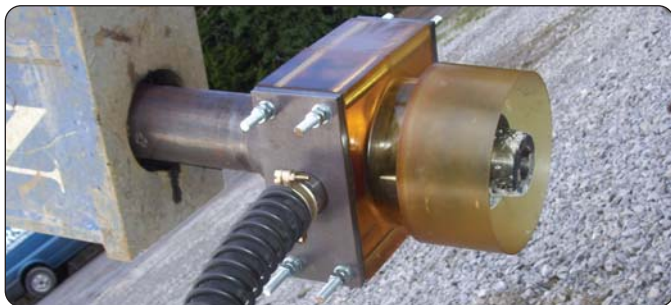
Grouted drive adaptor