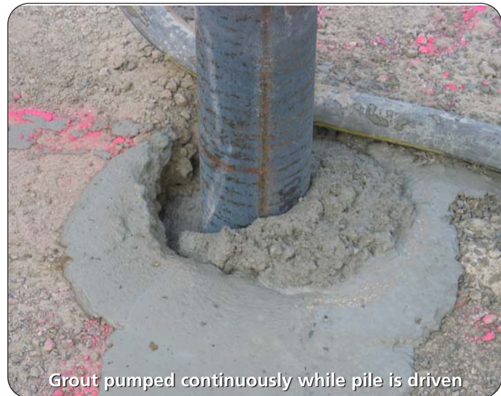
Grout pumped continuously while pile is driven