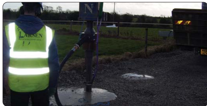
No spoil created