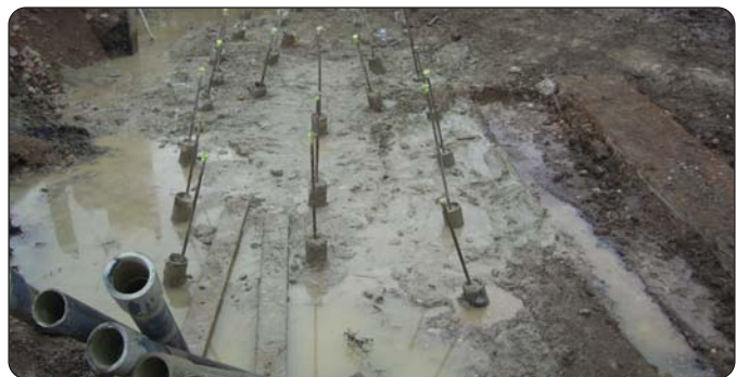
Piled bridge pier