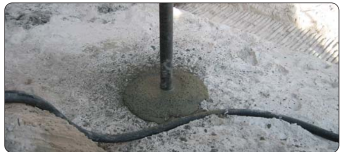
Continuous grouting while pile is driven