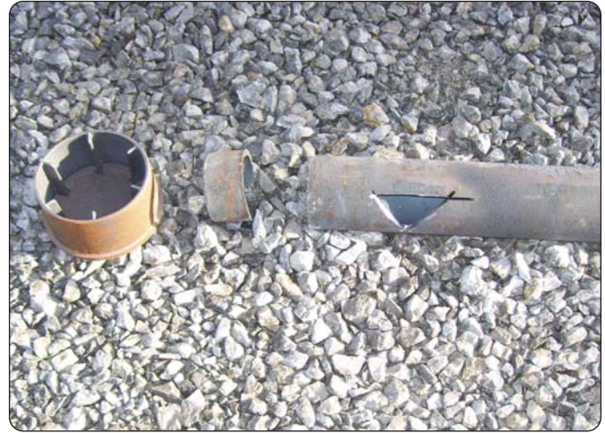
Components for grouted pile