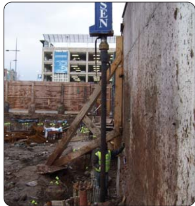
Pile close to listed building