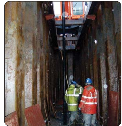
Reach into excavations