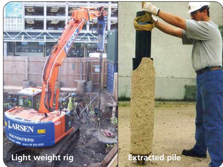
Light weight rig

Larsen have provided cost effective solutions for foundation problems since 1987. We have a first class reputation for meeting the needs of both domestic and industrial clients throughout Ireland.