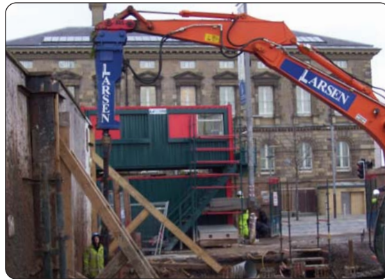
Reach over 4m to pile locations